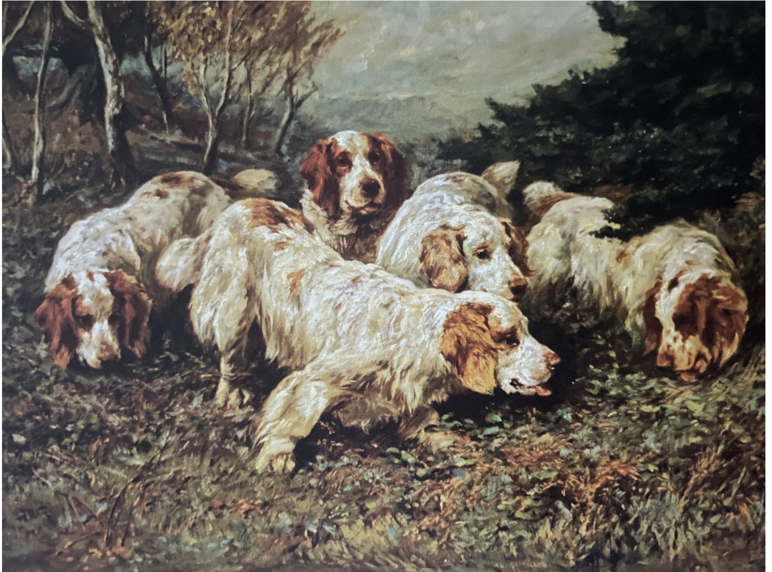
Clumber Spaniels at Clumber Park, early 1880's