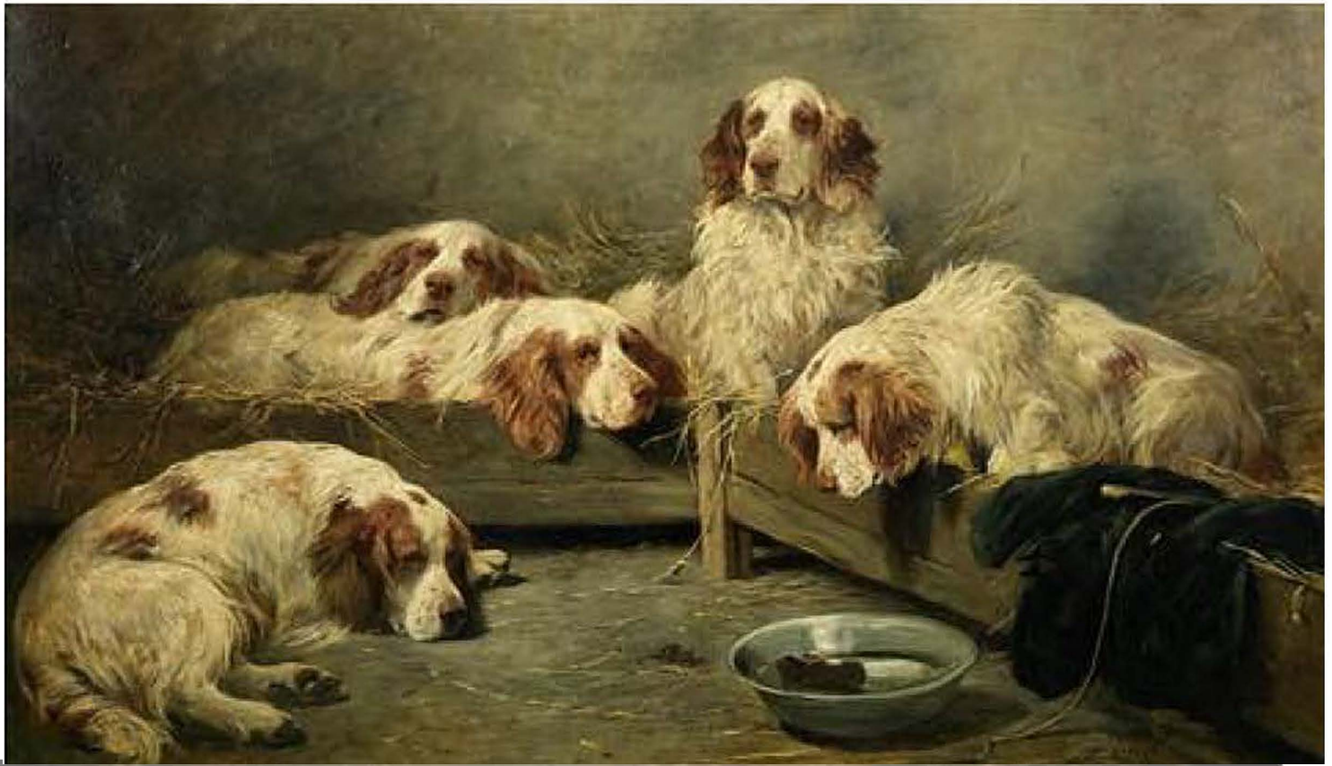
Cover of UK Kennel Club All-Breed Standards Book 2017